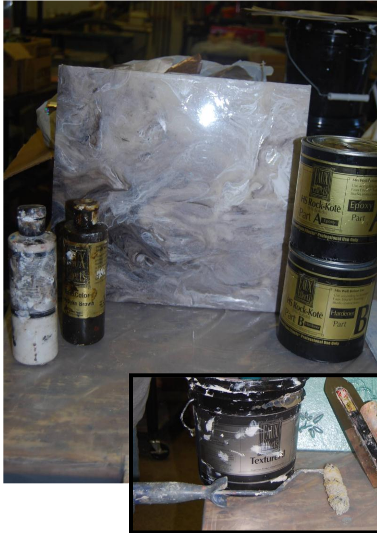
Products used for roll on / knock down finish